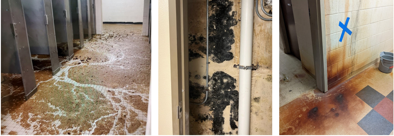
Photos shown above are from the GAO's 2023 report on military barracks.

wake of GAO's recent report, however, the military services have revisited their assumptions about unit cohesion, with an eye towards leadership measures that would mitigate these concerns.